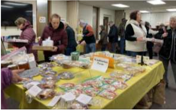
People arrived at start time and vigorously selected what they wanted

On November 23 St. Philip's conducted its annual Bake, Soup and more recently Quilt Sale. The bake sale included lefse which drew interest along with the sale's reputation as having valued goods for sale. Proceeds from the sale were $5,645, the highest ever.