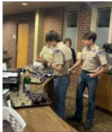
Scout Troop 9023 assembled beverages for distribution