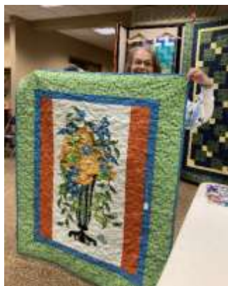
A large number of quilts were also sold that day and in the week that followed